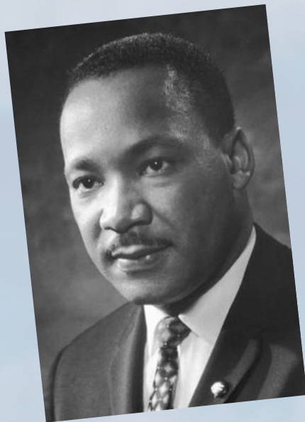
MARTIN LUTHER KING - PROFILE

STEP 1 — Who is Martin Luther King? Filling of an identity card using information from Vikidia